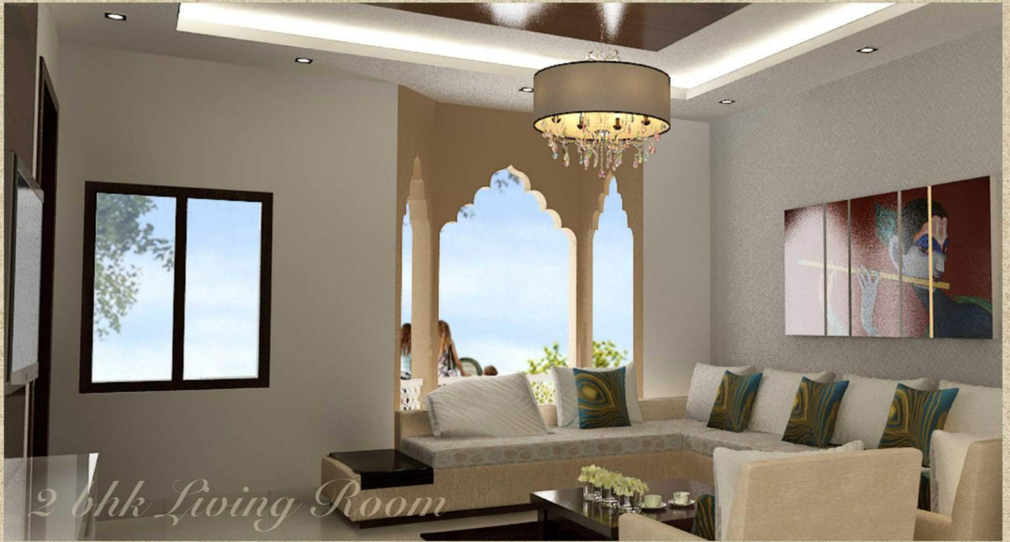
2 bhk Living Room