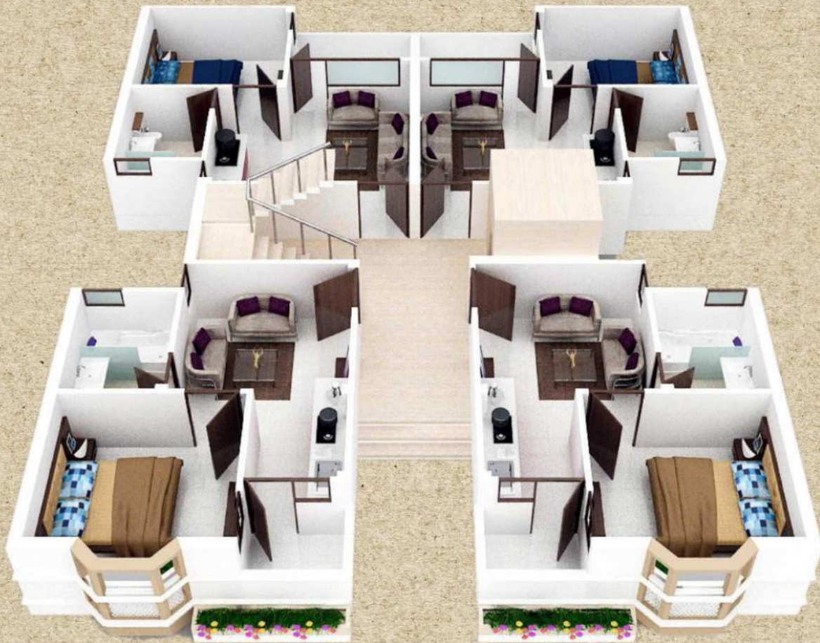
1 Room Apartment Layout Plan